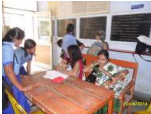
High school students in uniform, registering at one of the registration desks