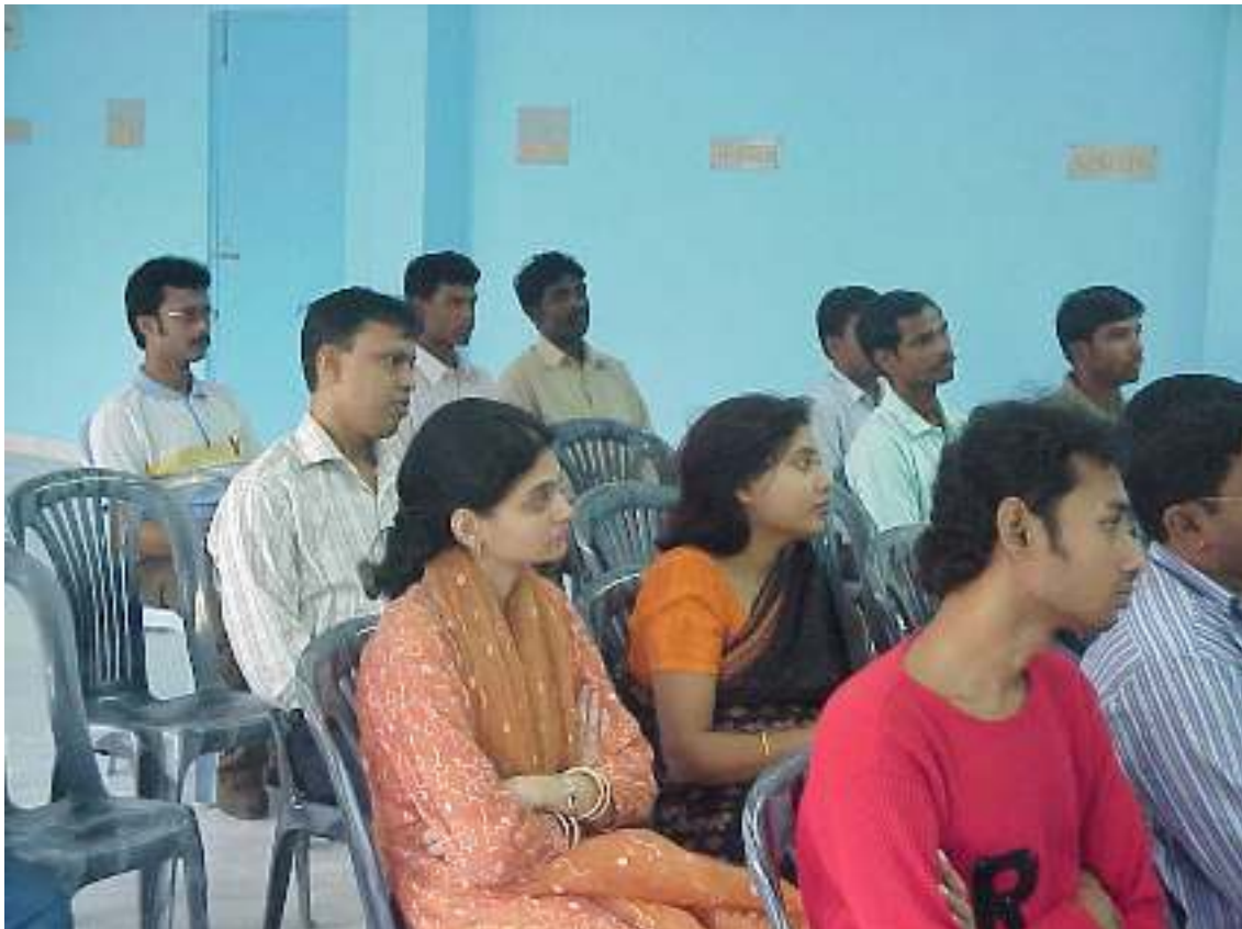
A section of Participant with Faculty members

Result: The participants have shown their interest through out the course. Feedback of the participant is totally positive and they also asked for the same type of program in near future.