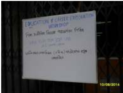
Education and Career Exploration Workshop

Education and Career Exploration Workshop was conducted for the socially disadvantaged high school students of Kolkata. This is to enhance overall academic performance of students (primarily girls) in middle and high school and prepare them for higher education and better career placement in future. Around 150 girls students from Jagadish Vidyapeeth for Girls, Kasba, Kolkata were attended the program.