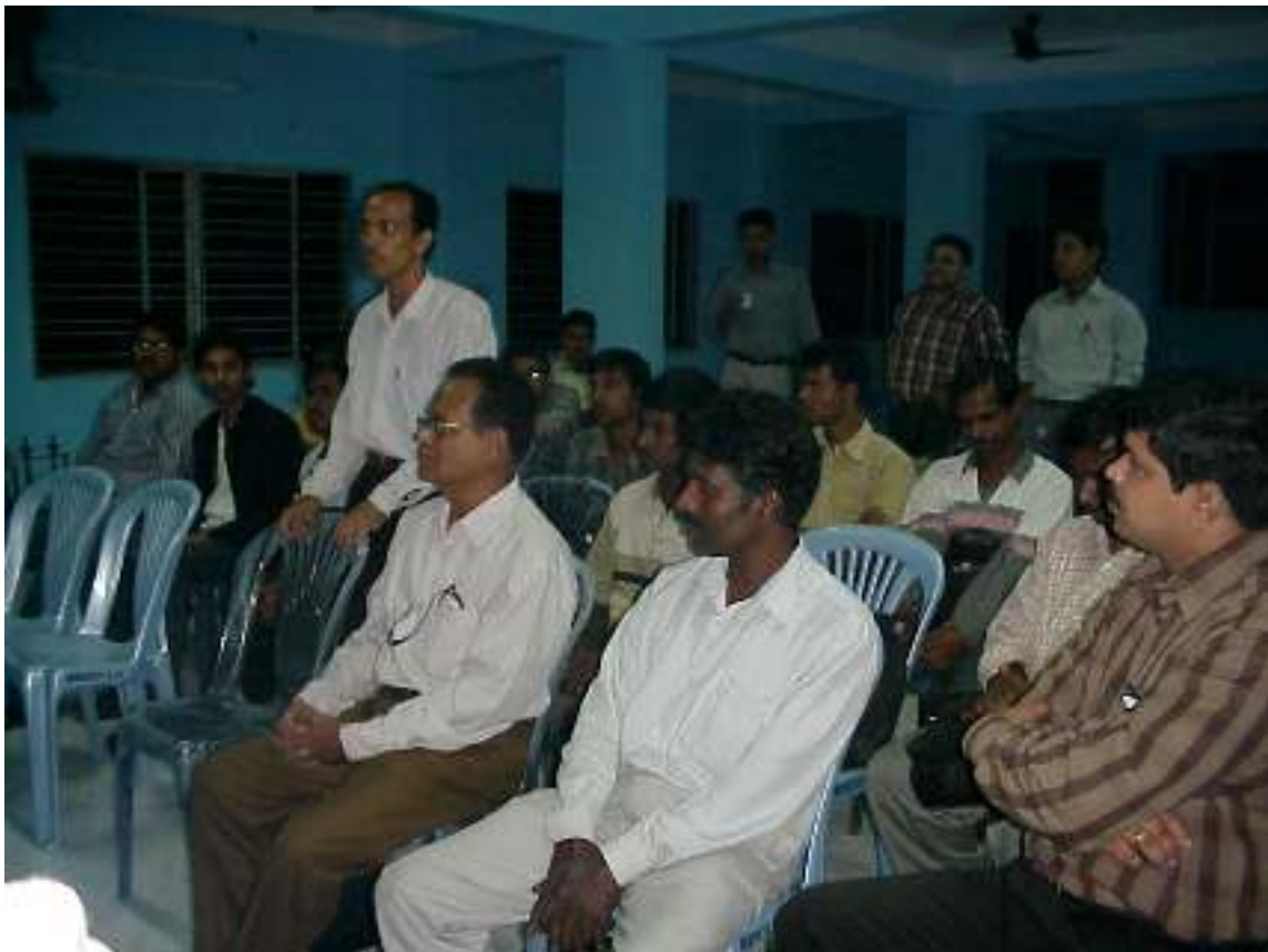
A section of Participant during concluding session

Result: The participants have shown their interest through out the course. Feedback of the participant is totally positive and they also asked for the same type of program in near future.