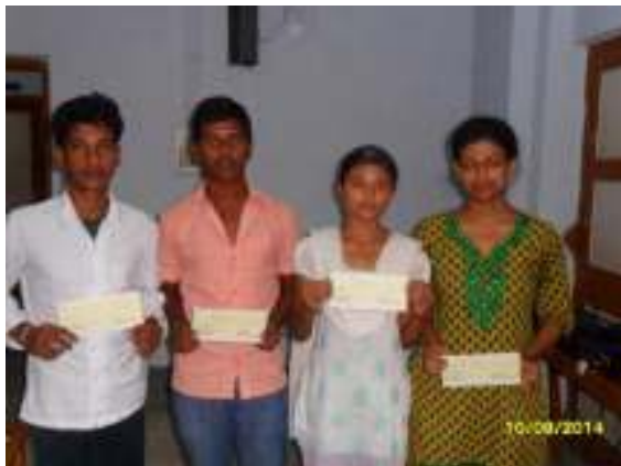
Four recipient of 2014 ABMF annual scholarships