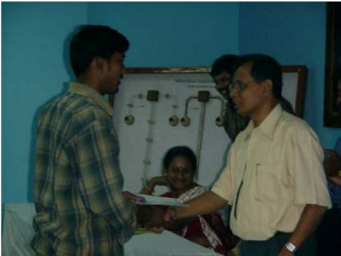
Participant Receiving Certificate

Result: The participants have shown their interest through out the course. Feedback of the participant is totally positive and they also asked for the same type of program in near future.