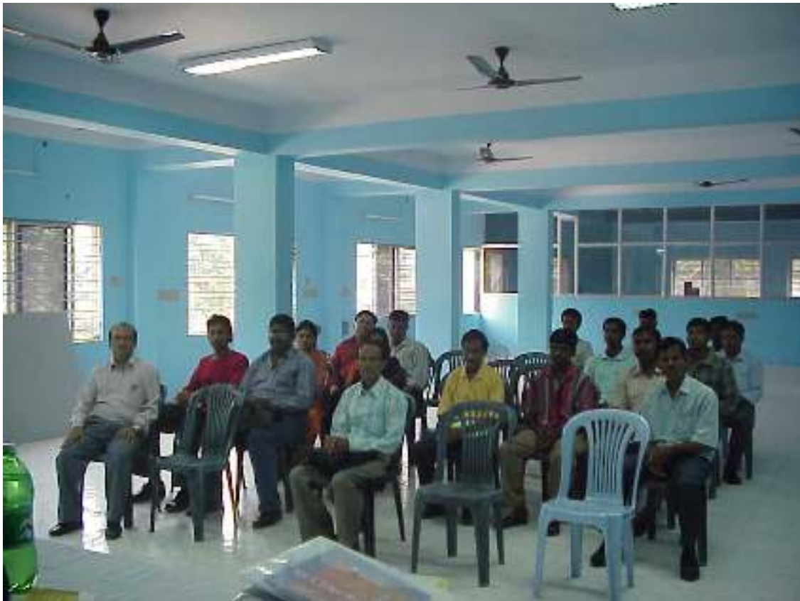
A Section of Participants

Result: The participants have shown their interest through out the course. Feedback of the participant is totally positive and they also asked for the same type of program in near future.