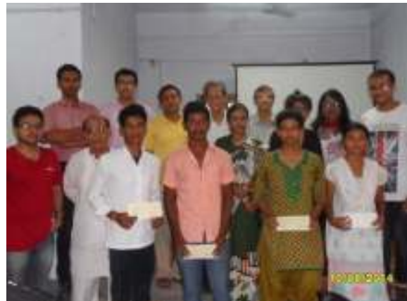
volunteers with the scholarship recipients